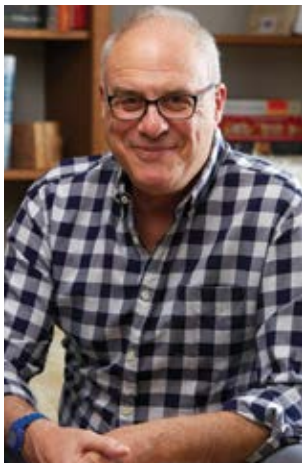
Mark Bittman is a best-selling cookbook author and former New York Times food columnist.

"The first thing I do when I get home is put a pot of water on the stove to boil." That bit of wisdom comes from Mark Bittman, best-selling author of the How to Cook Everything cookbook series, former New York Times columnist, and widely published writer and speaker on the politics of food.